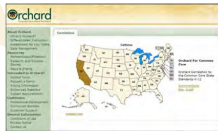
Common Core and State Correlations and Assessments