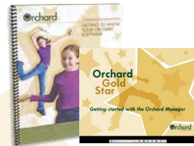
Online Training Resources